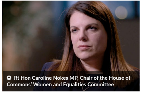
👤 Rt Hon Caroline Nokes MP, Chair of the House of Commons' Women and Equalities Committee

The Government recently admitted that the trend away from single-sex toilets is placing "women at a significant disadvantage".