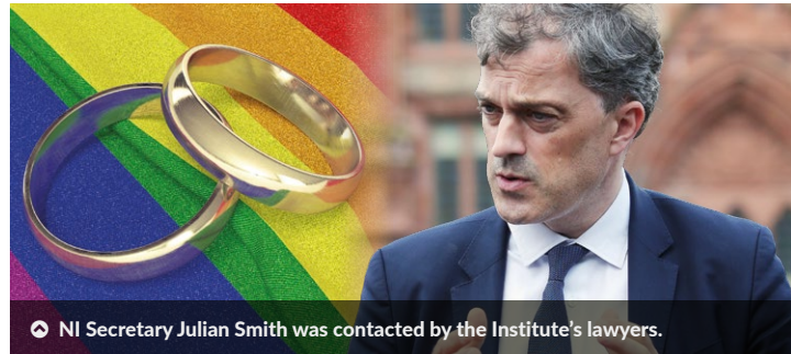
➤ NI Secretary Julian Smith was contacted by the Institute's lawyers.

Acting on behalf of the Institute, Belfast solicitors Carson McDowell wrote to NI Secretary Julian Smith in November. They said regulations should offer "no less in the way of legal