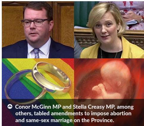
➤ Conor McGinn MP and Stella Creasy MP, among others, tabled amendments to impose abortion and same-sex marriage on the Province.

Lord Morrow's amendments to introduce protections