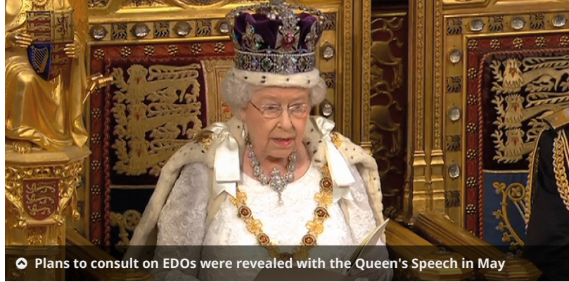
Plans to consult on EDOs were revealed with the Queen's Speech in May

The Defend Free Speech campaign, which is supported by The Christian Institute, wrote to the Home Office in January calling for a consultation. In May, the Government announced that the new "civil order regime to restrict extremist activity" would be introduced "following consultation".