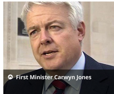
◀ First Minister Carwyn Jones

The change is supported by Labour and Plaid Cymru. But a poll released in 2014 showed that 7 in 10 people in Wales opposed a ban on parents smacking their children.