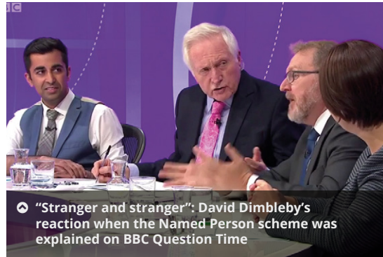
“Stranger and stranger”: David Dimbleby’s reaction when the Named Person scheme was explained on BBC Question Time

If implemented under current wording, every child in Scotland will be assigned a state guardian to monitor their 'wellbeing'.