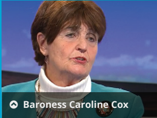
Baroness Caroline Cox

A Government review into the application of sharia law in England and Wales has begun. Persistent concerns have been raised that women are suffering because of sharia law, with Baroness Caroline Cox – a Patron of The Christian Institute – speaking out repeatedly on the issue. The review is expected to conclude in 2017.