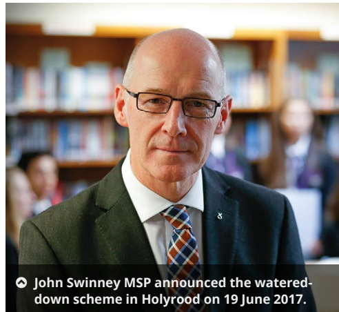
John Swinney MSP announced the watered-down scheme in Holyrood on 19 June 2017.

Campaigners welcomed the comments, with the No to Named Persons group saying the Scottish Government needs to "scrap the scheme altogether".