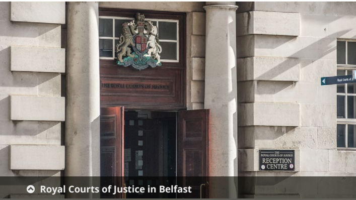
Royal Courts of Justice in Belfast

The High Court in Belfast has dismissed two legal cases which sought to have same-sex marriage introduced to Northern Ireland.