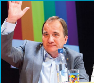
🕒 Swedish Prime Minister Stefan Löfven

But Stefan Löfven indicated that he would back making support for same-sex marriage a requirement for ordination.