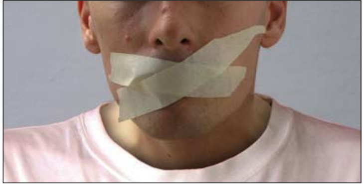
The perception of the 'victim' can be crucial to proving harassment

went well beyond what was required when implementing another directive containing harassment.