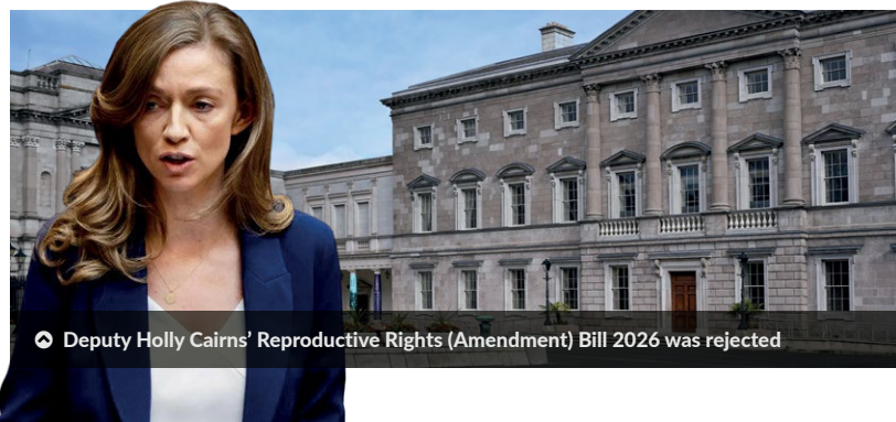
▶ Deputy Holly Cairns' Reproductive Rights (Amendment) Bill 2026 was rejected

One man was recently sentenced to eleven years for procuring pills and forcing his pregnant girlfriend to take them against her will, resulting in the death of their nine-week-old baby.