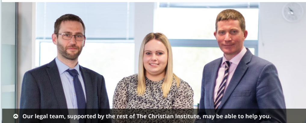
⬆ Our legal team, supported by the rest of The Christian Institute, may be able to help you.

CONTACT US | ☎ 0191 281 5664 | @ LDF@christian.org.uk