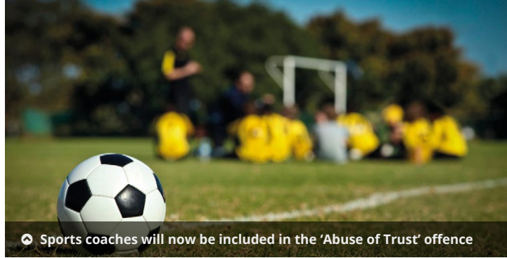
➤ Sports coaches will now be included in the 'Abuse of Trust' offence

The Institute supported the new offence but warned that its scope was far too narrow. In a five-year campaign we met with the then Home Secretary Jack Straw to urge him to tighten the law. We also worked directly with the late Lady Blatch and the late Lady Young to close a series of loopholes including part-time pupils and mentors. Tragically, the amendment to include sports coaches was blocked by