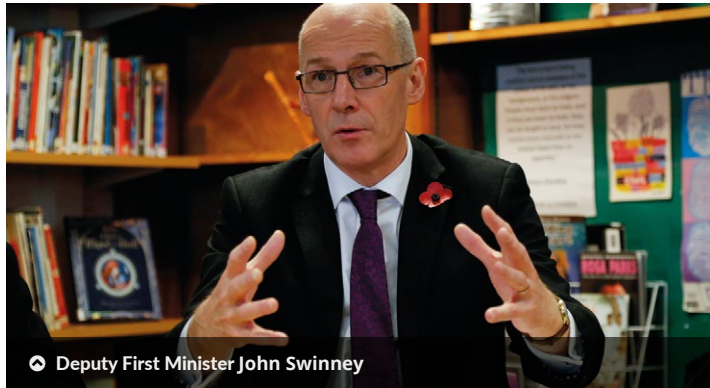
Deputy First Minister John Swinney

Along with Conservative and Labour MSPs, NO2NP is calling for the scheme to be abandoned.