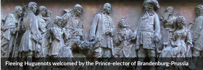
Fleeing Huguenots welcomed by the Prince-elector of Brandenburg-Prussia

The renewed study of the Bible during the Renaissance helped prepare the way for the Protestant Reformation. At its core, the reformers rediscovered the Bible's teaching that salvation is a gift of God's free grace. The reformed church spread quickly in Europe. In France it gained ground despite vicious persecution from the authorities. 4