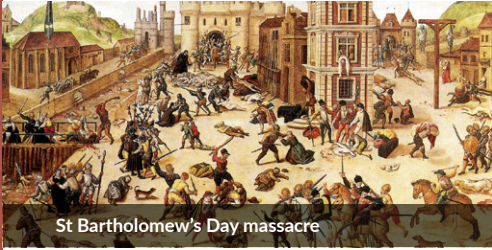
St Bartholomew's Day massacre

On the death of the King Henry II in 1559, real power in France passed to the nobility, many of whom had, by that time, become Protestant. Political influence was precariously balanced between the Roman Catholic House of Guise and the Protestant House of Bourbon. 16