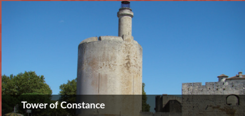
Tower of Constance

50,000; another 10,000 fled to Ireland. 52 Large numbers settled in London as well as places like Barnstaple, Bristol, Canterbury, Dover, Exeter, Norwich, Rye, Southampton, Winchester and north-east England. 53 In East Anglia, Huguenot refugees helped drain and reclaim 40,000 acres of fenland. 54