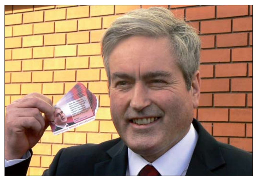
Scottish Labour Leader Iain Gray

single Act. Yet the Bill as introduced would have narrowed the employment freedom of churches and religious organisations even further than the 2003 employment laws (see above). The House of Lords voted three times against any narrowing of the 2003 legislation and the previous Government eventually gave way. The legislation, which is now the Equality Act 2010, also places a duty on public bodies - like schools and the police - to promote homosexual and transsexual rights. It may also have a negative impact on private or voluntary bodies with Government contracts. Scottish Labour's 2011 manifesto says: "We will develop strong guidance for the effective implementation of the public duties under the Equality Act."55