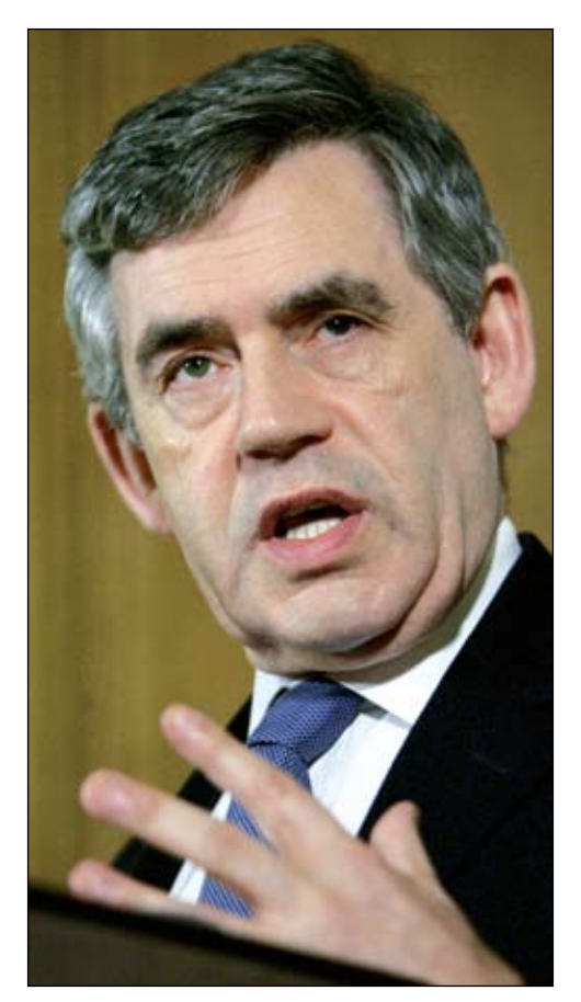
Prime Minister Gordon Brown

The Licensing Act 2003 allowed for 24-hour drinking , which came into force in 2005. The Act also brought lap-dancing clubs under 'entertainment' licensing which allowed a proliferation of lap-dancing venues across the country. In 2009 the Government reversed its liberalisation by moving lap-dancing clubs