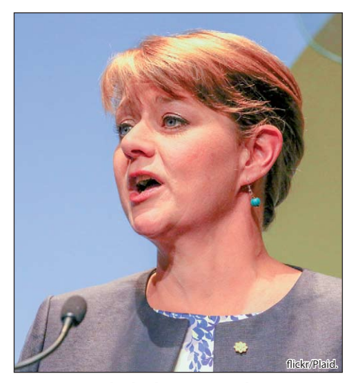
Leanne Wood, Plaid Cymru Leader

Alcohol – Plaid Cymru supports the introduction of a minimum pricing policy for alcohol.<sup>220</sup>