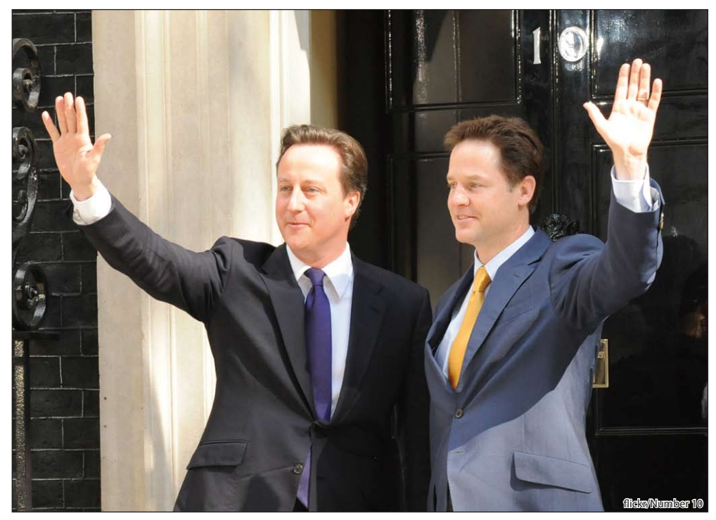
Prime Minister David Cameron (Conservative) and Deputy Prime Minister Nick Clegg (Liberal Democrat) outside 10 Downing Street after forming a coalition Government in May 2010.

Despite describing the marriage tax break measure as "patronising drivel" before entering into coalition, the Lib Dems agreed not to block its introduction. However, the Lib Dems say the tax break will penalise unmarried couples and are committed to abolishing it.<sup>22</sup> The Prime Minister has said he wants to see the marriage tax break "expanded" should he remain in power.<sup>23</sup>