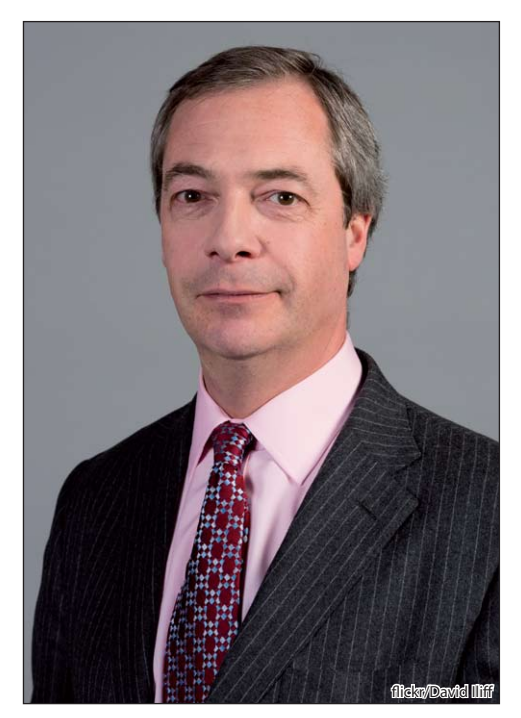
Nigel Farage, Leader of UKIP

Drugs – The party's 2015 manifesto says, "We will not decriminalise illegal drugs", 238 although Nigel Farage has previously called for a Royal Commission to look at options for legalising certain drugs, and describes the current approach to drugs as "neither practical nor effective", 239