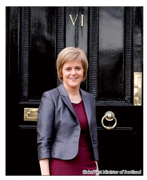
Nicola Sturgeon, First Minister of Scotland and Leader of the SNP

GM babies – When the House of Commons voted on plans to allow genetically modified babies with three or four parents, four SNP MPs voted in favour; two voted against.